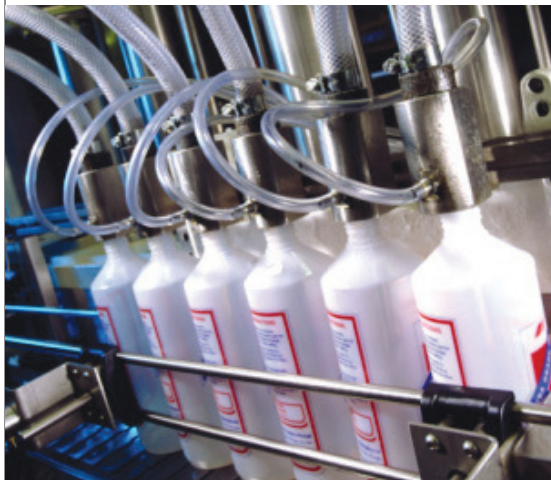
Maco Pkg has the liquid fill, dry fill and converting capacity to handle whatever you're into.

Maco Pkg gives you room to create, experiment and grow— now